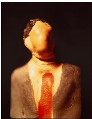
Laurie Simmons & Allan McCollum, Untitled from the series Actual Photos (ZM-1-Y) , 1985 Silver dye bleach print; edition 1 of 10 10 x 7 ½ in. (sheet), Gift of Alice and Marvin Kosmin, ©Laurie Simmons & Allan McCollum