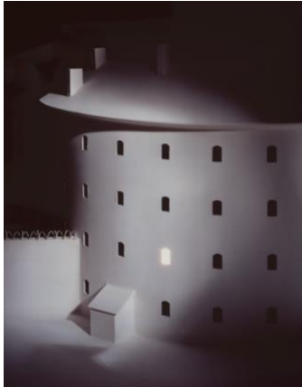
James Casebere, Panopticon Prison #3 , 1992, Cibachrome photogram; edition 1 of 5, 38 x 29 ½ in. (sheet), Linda Pace Foundation Collection, Ruby City, San Antonio, Texas © James Casebere