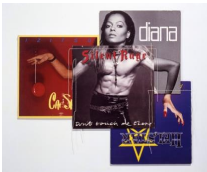
Christian Marclay, Silent Rage (from the series 'Body Mix'), 1991, Collage of LP records with cotton thread 28 x 31 in., Linda Pace Foundation Collection, Ruby City, San Antonio, Texas